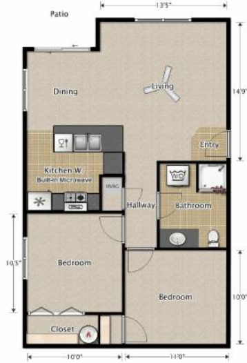
2 Bedroom 1 Bath End Apartment $750-$770 | 750 Sqft