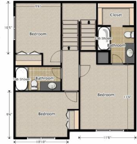
3 Bedroom 2.5 Bath Townhome | $970 | 1325 Sqft