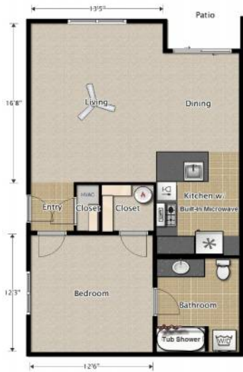
1 Bedroom 1 Bath Apartment $725 | 750 Sqft