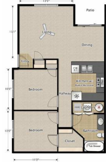
2 Bedroom 1 Bath Middle Apartment $765 | 805 Sqft