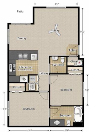
2 Bedroom 1.5 Bath End Apartment $785-$805 | 805 Sqft